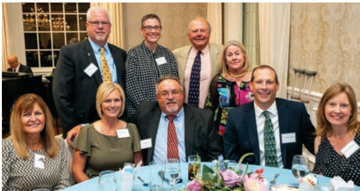
ABOVE: NextTier Bank team, Reception Sponsor

contributions were proof of their commitment to the noble cause of enhancing the quality of life for older adults and their communities, driven by the spirit of philanthropy and unity. ❖