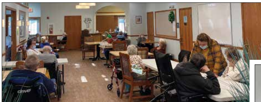
ABOVE: Participants spend purposeful days in the newly renovated Valley Care Adult Day Center that fosters relaxation, socialization and growth.

Valley Care Adult Day is a community-based program that offers a safe place for seniors to spend meaningful days among friends. Clients benefit from a wide range of health-related services including nursing, personal care, physical therapy, transportation, etc. The program also exists as a support for caregivers who need a break from providing routine care.