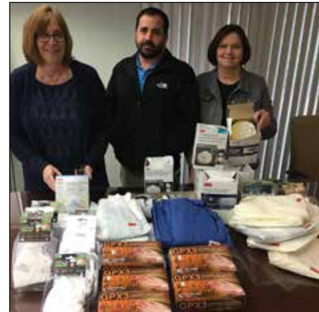
Several businesses answered our call for personal protective equipment (PPE) during COVID-19. Pictured above is Lutheran SeniorLife's donation from Ambridge Lumber Company and Volep Manufacturing Company.