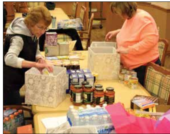
Valley Care Adult Day Center comforted participants during the pandemic with homemade care packages. Food staples and reading materials were just some of the many items personally delivered to each client's house.