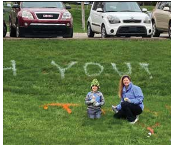
St. John Specialty Care Center employees received numerous acts of appreciation from family and members of the greater community once visitation restrictions were announced due to COVID-19.