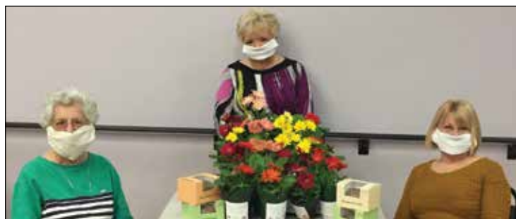
LEFT: Center at the Mall staff pose around the flowers they received from the Lutheran SeniorLife Foundation.

In addition to having the opportunity to bid on the many auction prizes, guests were also given the option to make a donation through the online auction site.