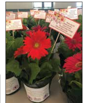
LEFT: PrimeTime Senior Center staff prepare to deliver flowers to our program participants in Allegheny County.