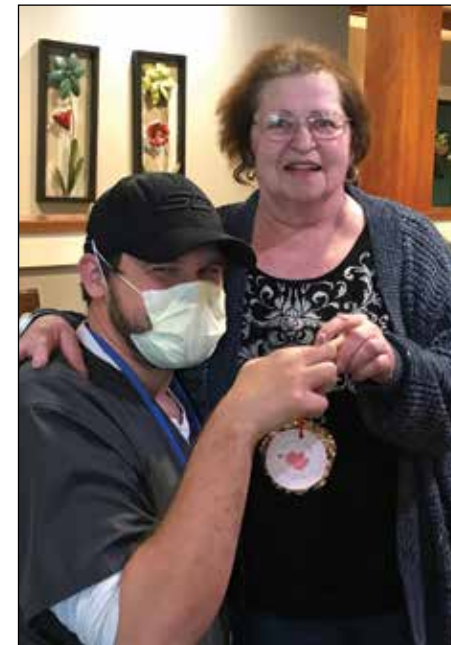
RoseCrest Assisted Living residents presented staff with bird feeder ornaments as a way to say "thank you" for taking care of them during this time.