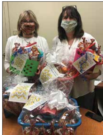
Passavant Community teams distributed treat baskets to our staff as tokens of appreciation during the pandemic.