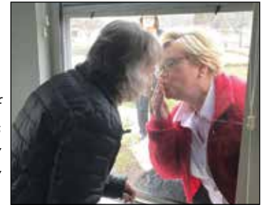
Many Lutheran SeniorLife staff embraced creative visitations as a way for our residents to safely connect with friends and family during the pandemic.