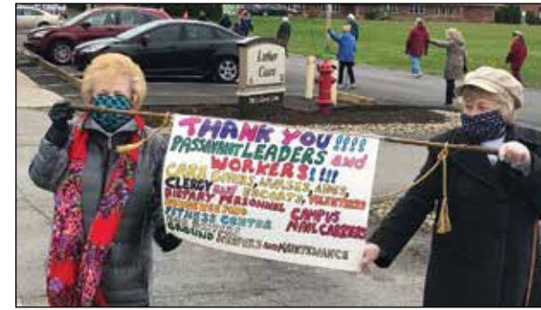
Passavant Community held a parade to lift our staff and resident's spirits during COVID-19. An emphasis was placed on appreciating our frontline heroes who provide quality care.