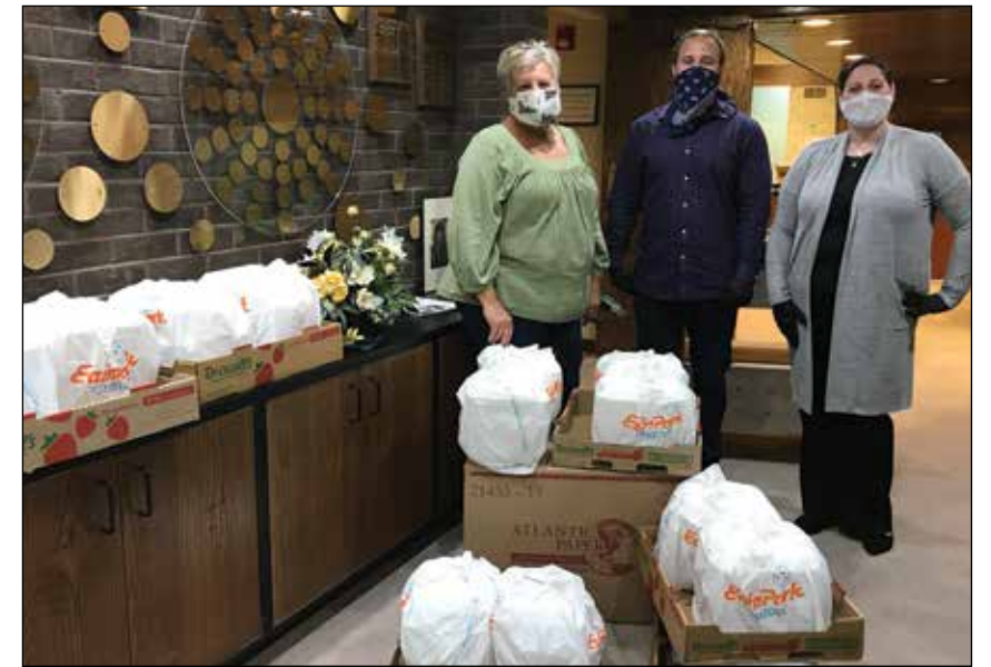
Enterprise Fleet Management graciously delivered Eat'n Park lunches to our VNA, Western Pennsylvania staff during COVID-19.