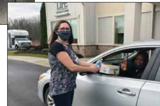
LIFE Lawrence County held a delicious drive-thru lunch for colleagues as a way to demonstrate appreciation and gratitude. Our LIFE teams have done a tremendous job ensuring that our participants receive the appropriate care and resources they need throughout this health crisis.