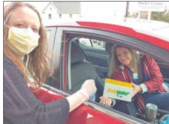
Our LIFE programs remained fully operational amid the pandemic to provide vital health services, such as daily meals, to our participants.