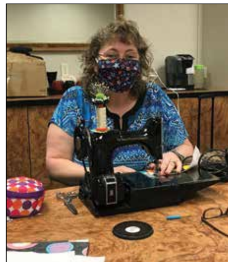
VNA, Western Pennsylvania started a handmade facemask campaign in response to the personal protective equipment (PPE) shortage. Thanks to the overwhelming support of others, their team collected more than 4,000 hand-made masks for internal distribution.