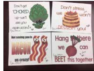
Passavant Community's dining team made our residents smile through the pandemic with food cards. Messages like "We can 'beet' this together" and "we're egg-static to be keeping you healthy" offered reassurance and support.