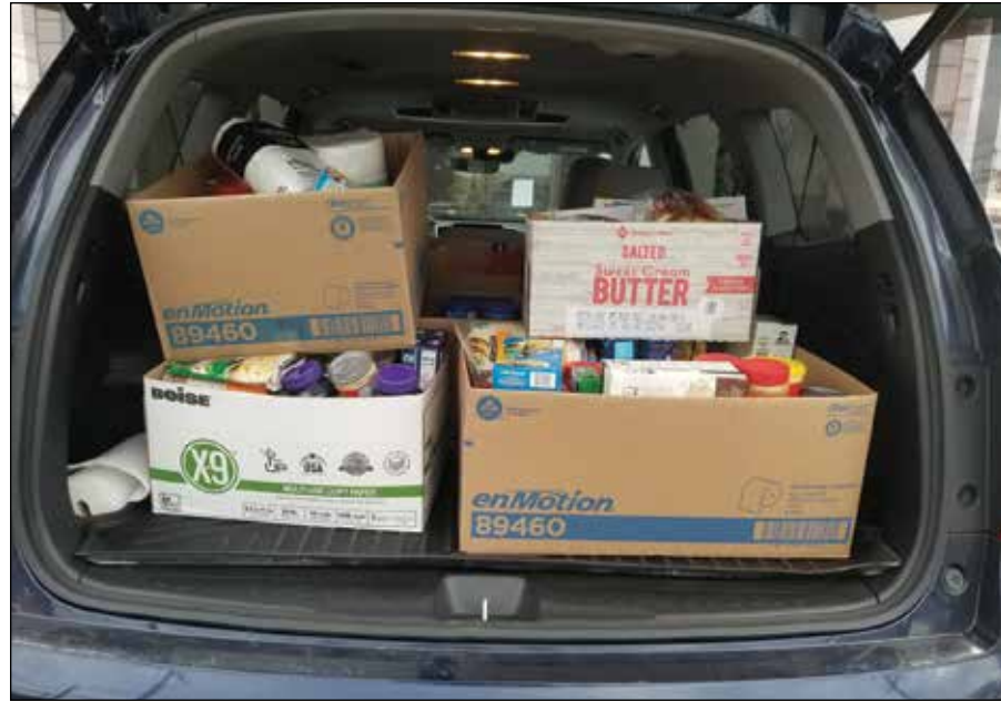
Our Freedom Rd. office participated in Victory Family Church's food distribution project, "Help Your Neighbor." The church distributed the non-perishable donations to those who needed them most within our community.