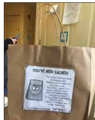
LIFE Beaver County staff began "sacking" lunch to one another as a way to boost employee morale amid COVID-19.