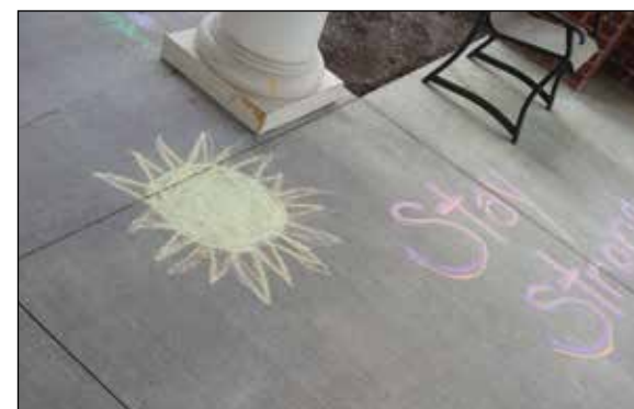
Passavant Community's Fitness Center staff brightened the days of our residents and employees with colorful messages of hope outside of our Abundant Life Center.