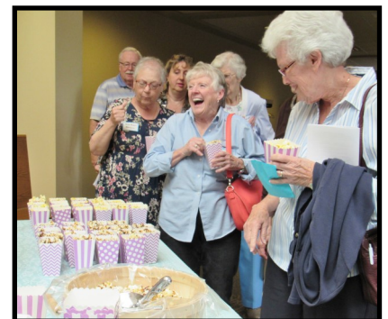
Those present for the video unveiling on May 15th were treated to gourmet popcorn.

Be sure to Like and Share these videos, starring your colleagues in ministry!